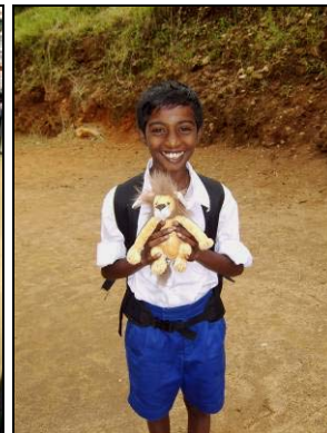
Macaldeniya students enjoy their presents