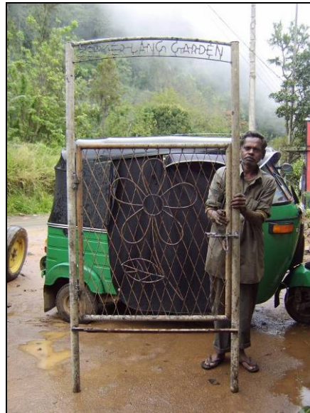
Macaldeniya garden gate, in progress