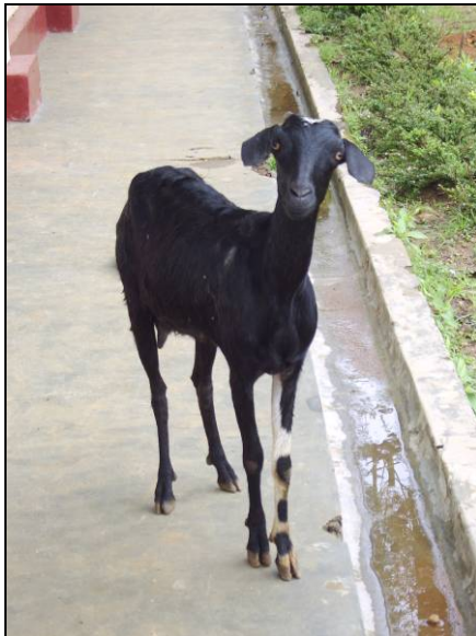
Pesky but cute, goats regularly wander the school grounds